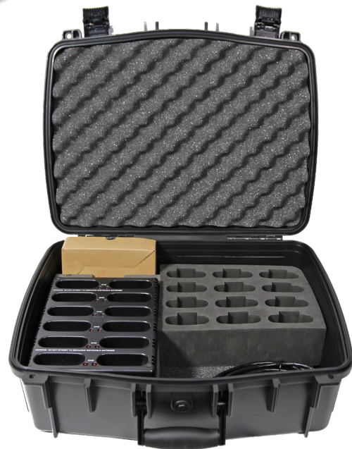
CHG 3512 PRO