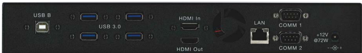
Back Panel of CR-100

For additional information, feature instructions, commands, warranty information and more, please download the full user manual from the CR-100's product page on Williams AV's website.