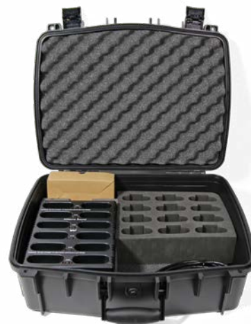
CHG 3512 PRO