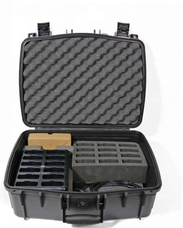
CHG 1012 PRO